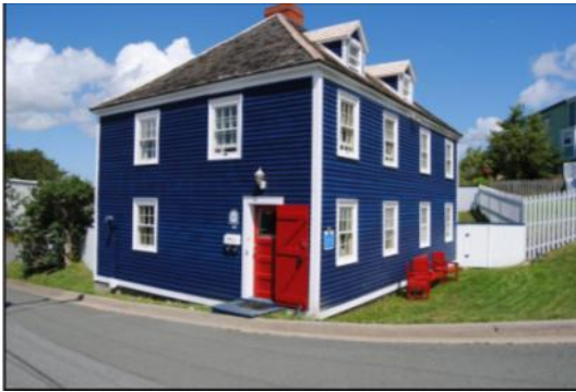
Anderson House, St. John's