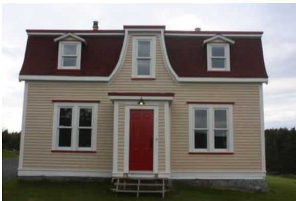
Hickey Family Homestead, Outer Cove